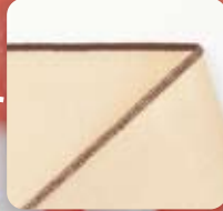
Frill 3 Thread Rolled Hem W/ Diff. Feed