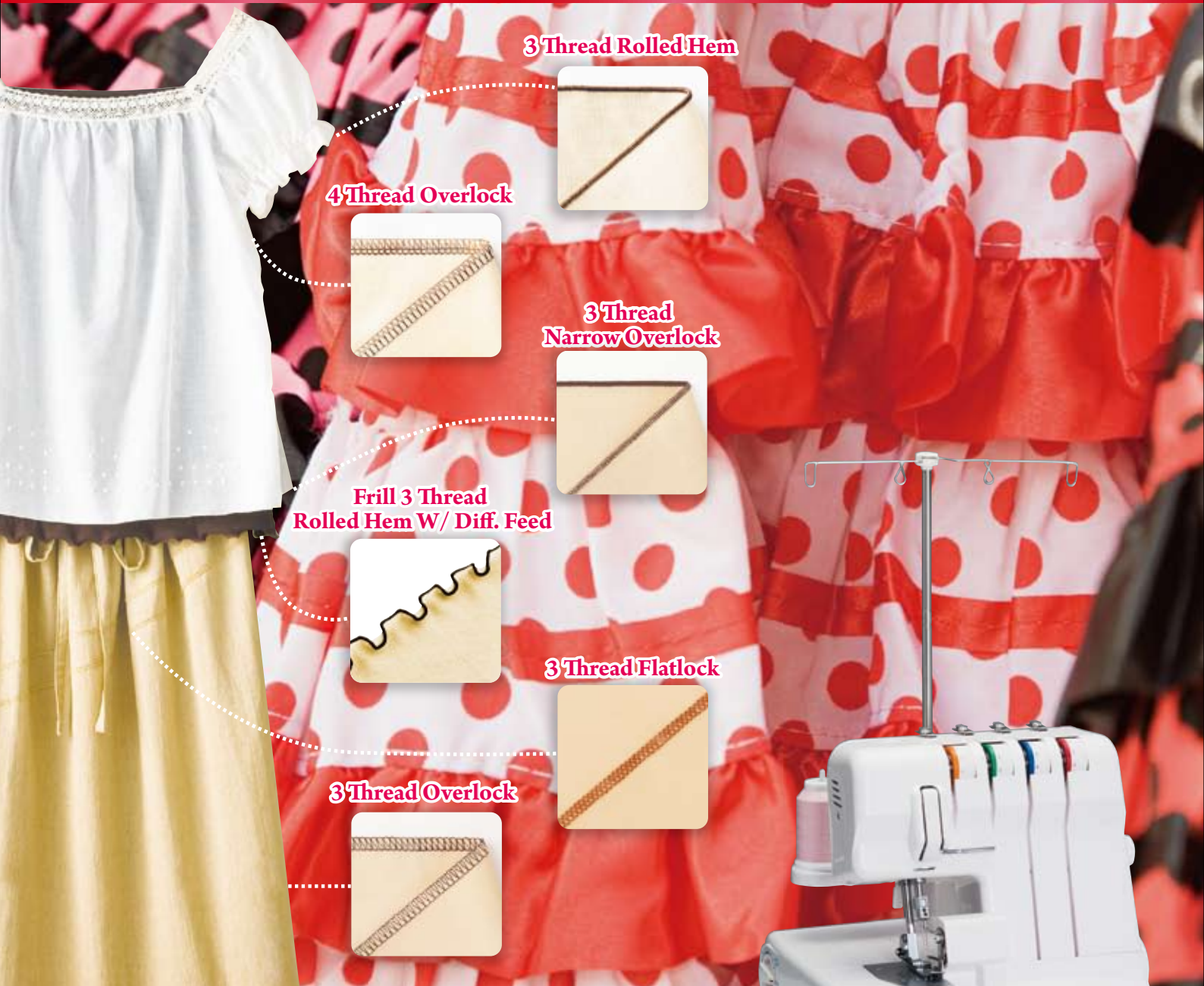
3 Thread Rolled Hem